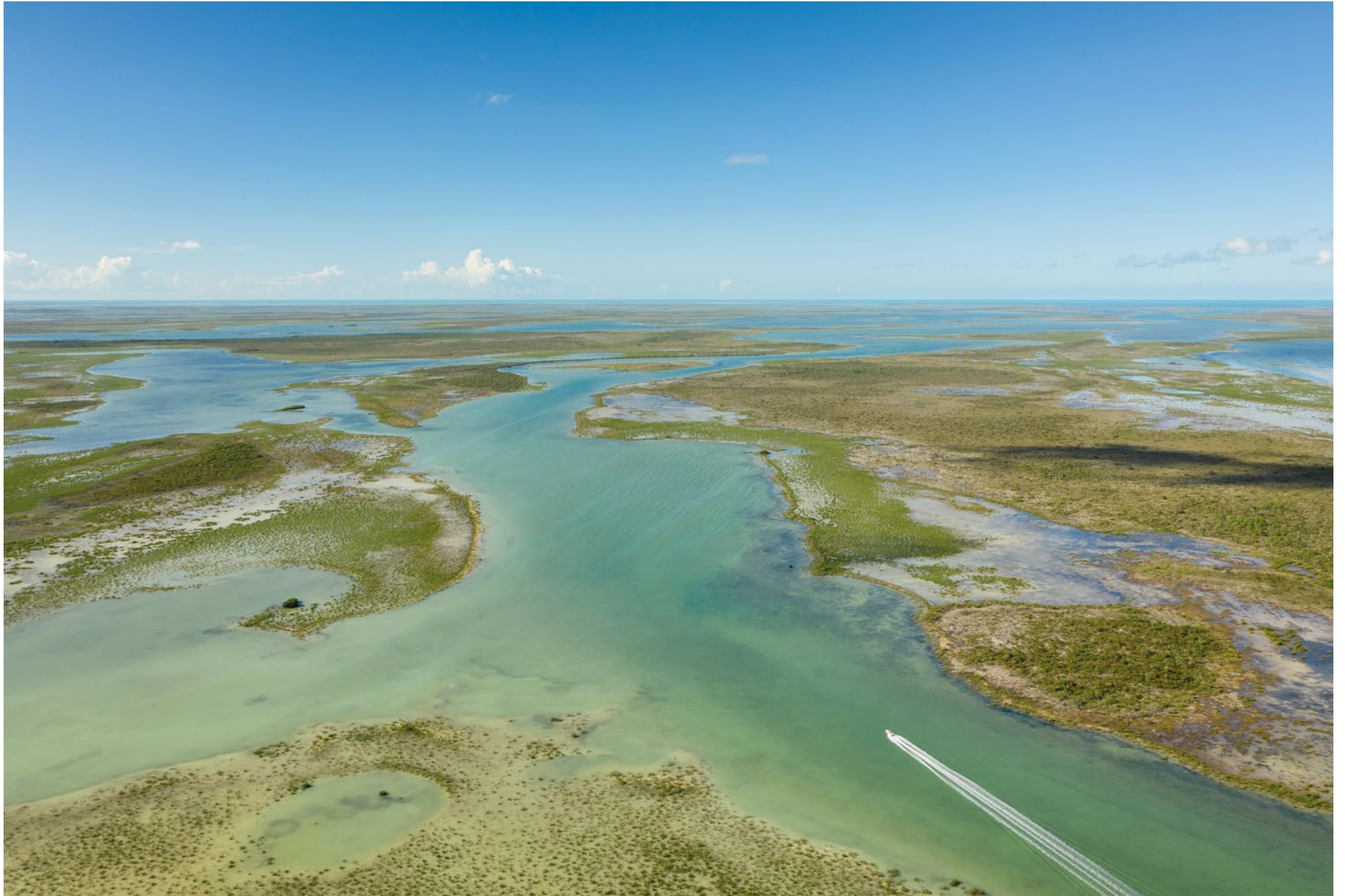
The lodge is a five-minute skiff run north or south to either Deep or Little Creek