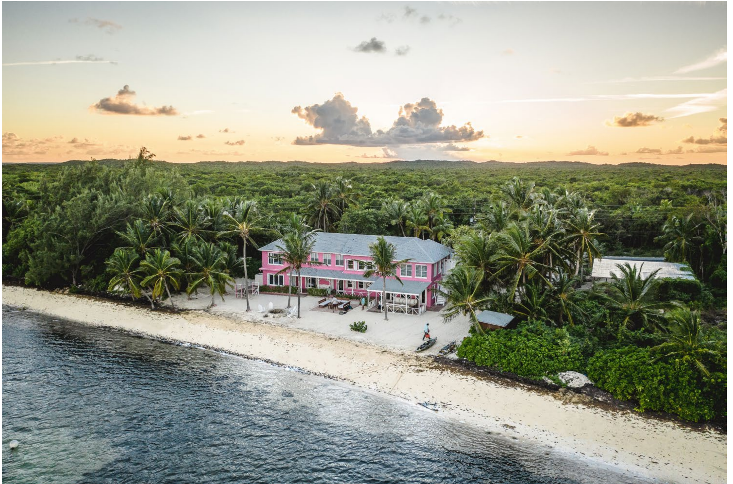
Bairs' Lodge is ideally located in front of the ocean, removing the need for trailering